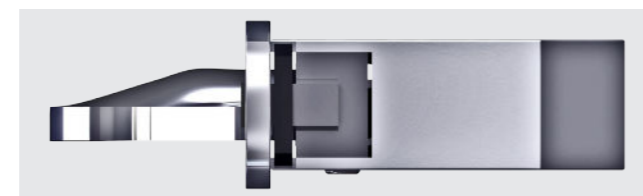
Special design tensile steel handed hook with a 4.5mm chamfer allows a high degree of fitting tolerance for door installation. In addition the hook shape provides low operating forces and helps doors achieve a higher level of weather performance.

Superbly engineered and manufactured in Germany the Trulock + Locking system is approved by the Police 'Secured by Design' security initiative. This important independent endorsement is an essential requirement of the Association of British insurers.