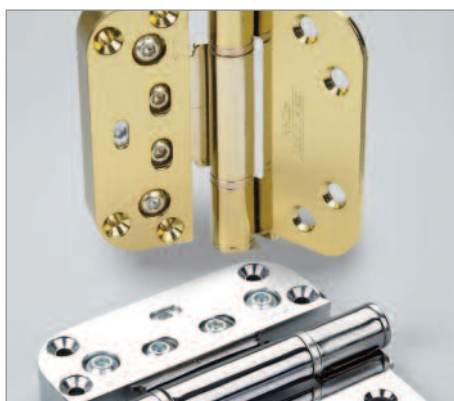
TOP: 4915 3D Adjustable Door Hinges in (left to right) white powder coating, Supercoat 500 and yellow zinc.